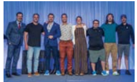
Black Hills Running Company EMERGING BUSINESS OF THE YEAR