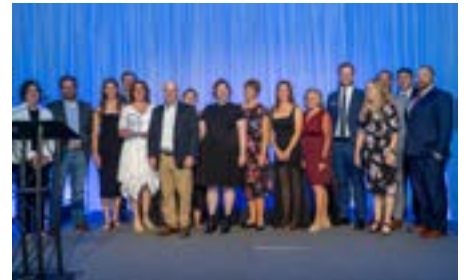
RESPEC BUSINESS EXPANSION OF THE YEAR