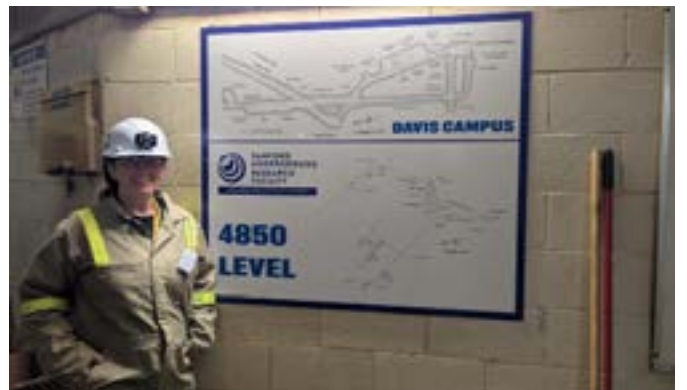
Shiloh embarks on underground tour of SURF.