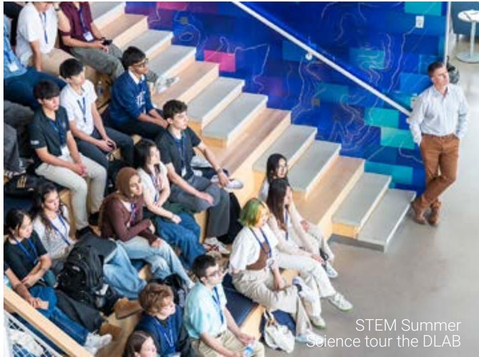
STEM Summer Science tour the DLAB