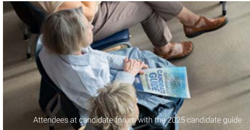
Attendees at candidate forum with the 2025 candidate guide