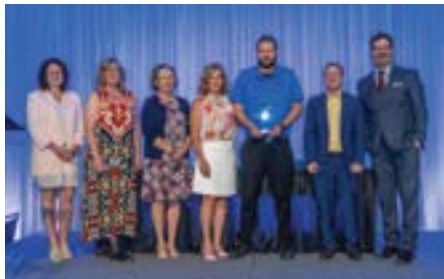
YMCA - Rapid City NON-PROFIT OF THE YEAR