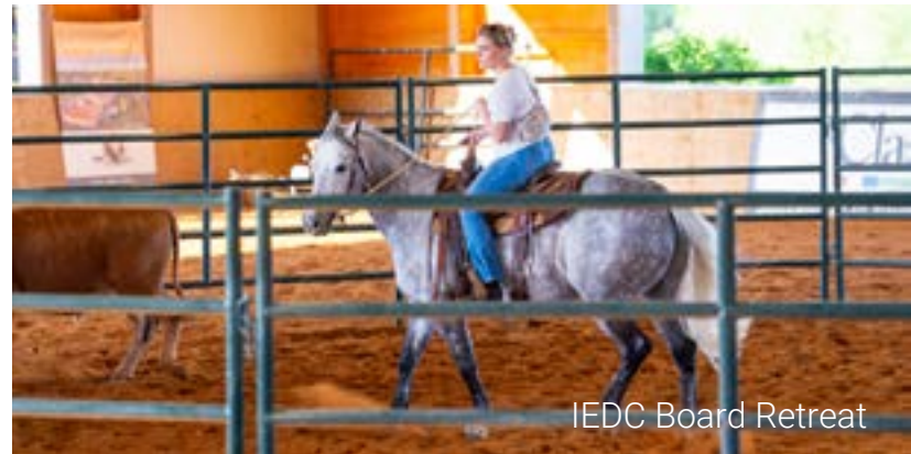
IEDC Board Retreat