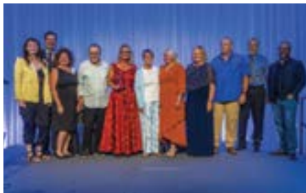
Black Hills Adventure Tours SMALL BUSINESS OF THE YEAR