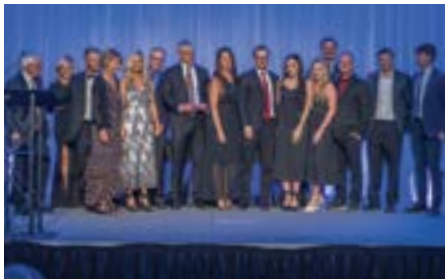
Coca-Cola High Country Bottling Company LARGE BUSINESS OF THE YEAR