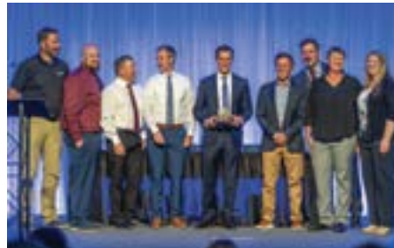
Liberty Superstores GRANITE AWARD