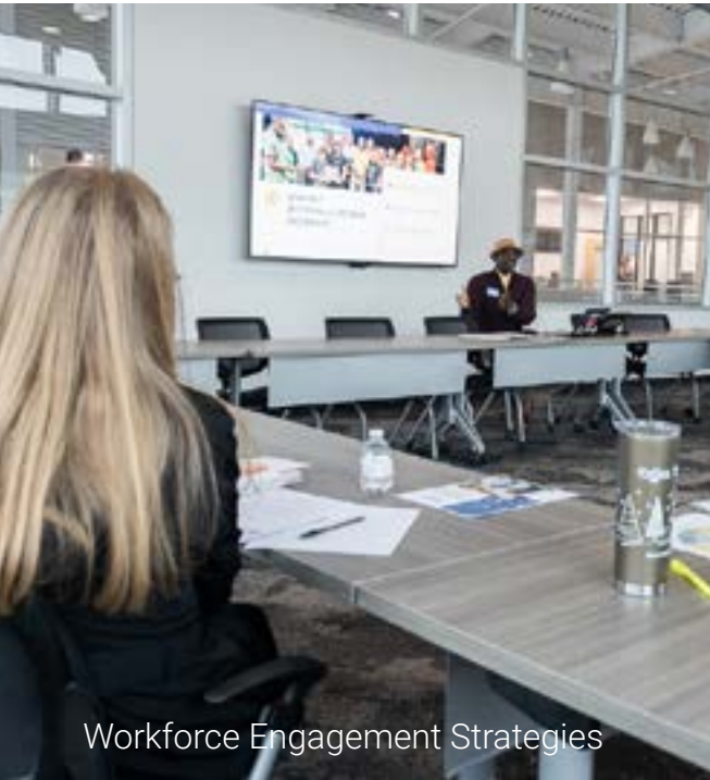
Workforce Engagement Strategies