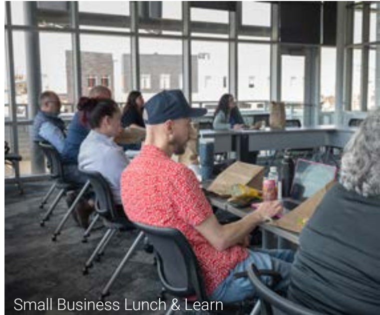
Small Business Lunch & Learn

** BRE = Business Retention Expansion Visit; A meeting with local business to assess their needs, address challenges and ID opportunities for growth.